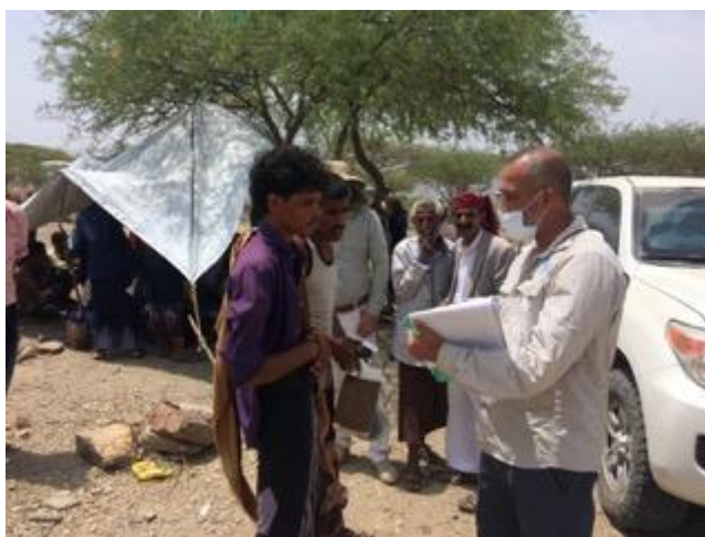
IDP Interview by TDI MAE