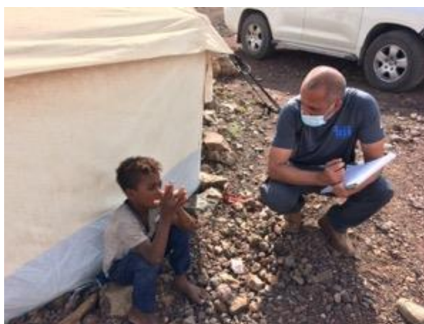
IDP Interview by TDI MAE