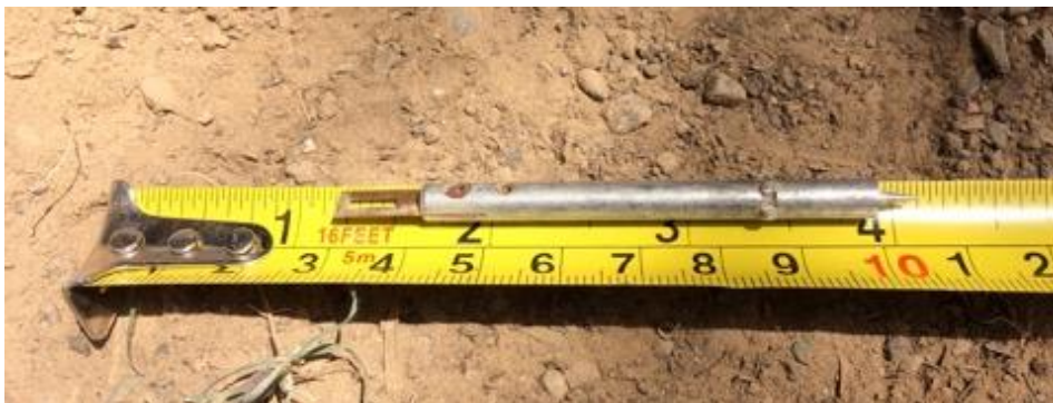
Striker of the copy of PPM2