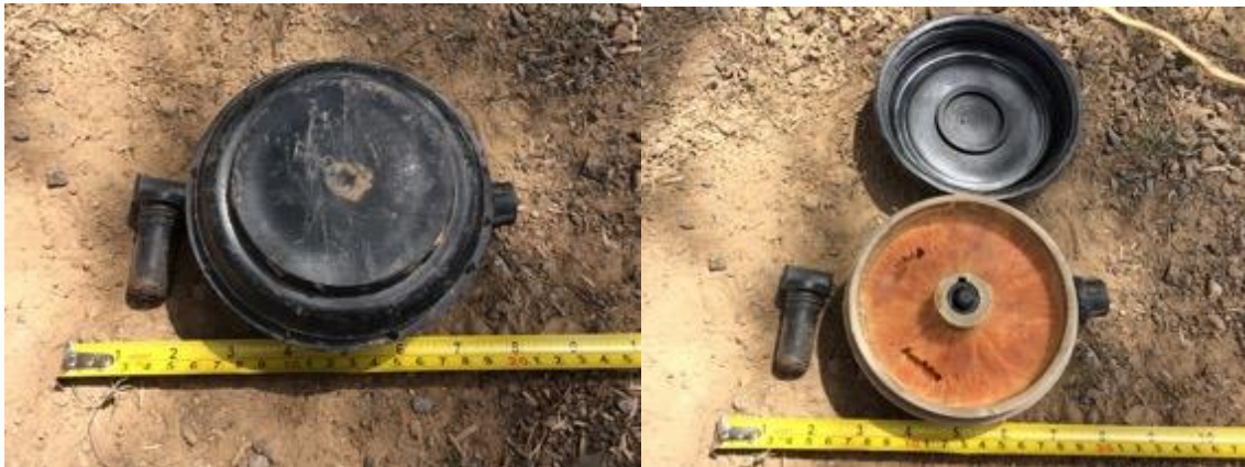
Homemade Copy of PPM2