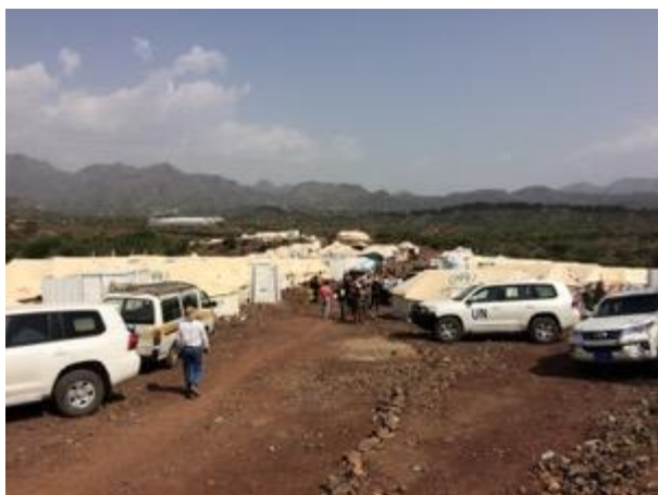
General View of the IDPs Camp Al-Qahfah