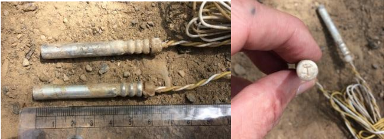
Electric det used to initiate the Claymore