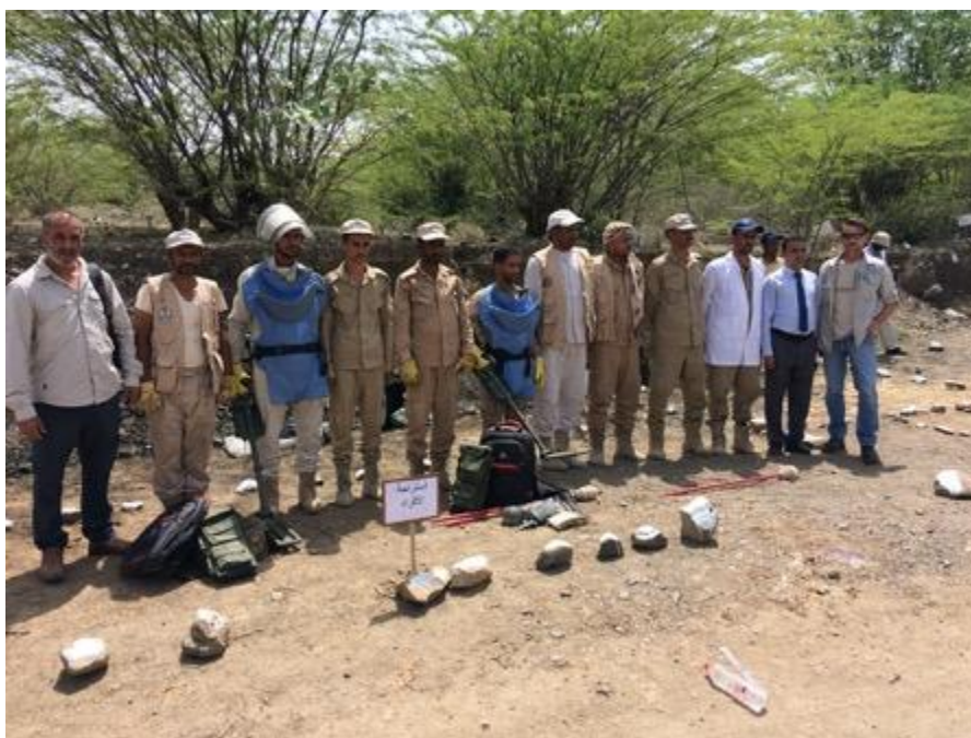
YEMAC Clearance Team with Both TDI MAE and YEMAC Branch director

TDI MAE confirm the need of training and equipment, however we have to assume that even with the lack of knowledge and equipment the clearance team are performing very well with good result, however this is not without taking risk.