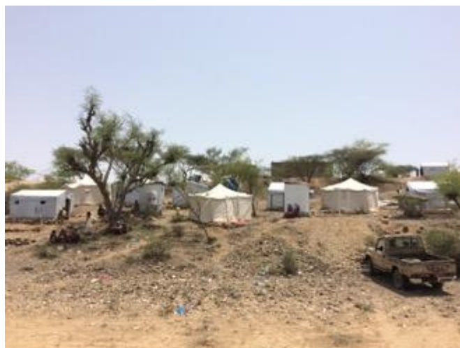
General view of Al-Rabah IDPs Camp: